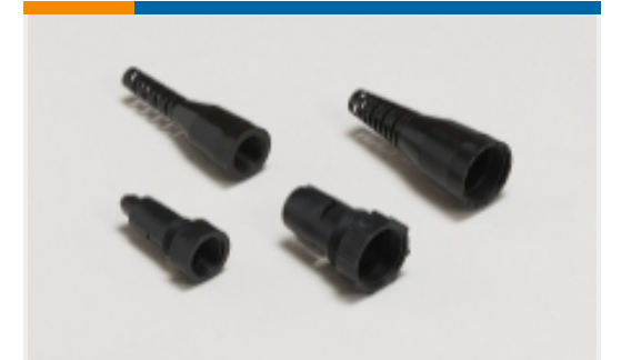
Connector Strain Relief(60)