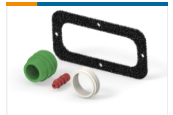
Connector Seals & Cavity Plugs(36)