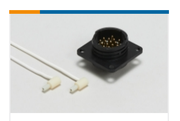
Circular Power Connectors(458)