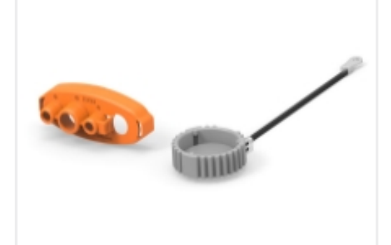
Connector Caps & Covers(16)