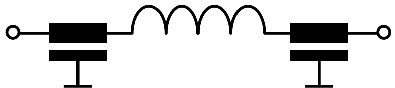
Typical Electrical Schematic